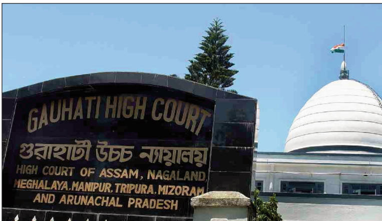
mining and cement production. Petitioners call it an "involuntary" seizure of ancestral territory. The proposed factory site, just nine kilometers from Umrangso town, cuts through two inhabited villages, Nobdi Longkukro (Dimasa) and Choto Larpheng (Karbi).

The company said the land was "only barren land," needed for