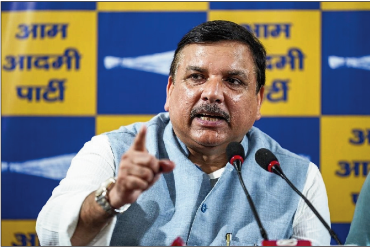
Himanta Biswas Sarma, Trinamool Congress Rajya Sabha leader Derek O'Brien on Sunday said, "More parties calling out Modi coalition's stunt to form a Joint Parliamentary Committee (JPC). VALUELESS JPC."